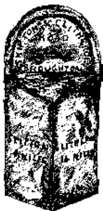
MILE STONE, BROUGHTON, GRADE II LISTED STRUCTURE

Listed Buildings or structures, are those that are considered to be important enough to warrant special planning control. Such buildings and structures are included on a list of buildings of special architectural or historic interest , which is compiled by the Secretary of State for Culture, Media and Sport.