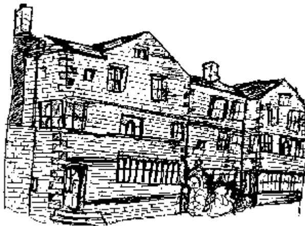
THE FOLLY, SETTLE, GRADE I LISTED BUILDING

Listed Buildings are classified in three grades to show their relative importance, these are Grade I, Grade II* and Grade II. Grade I and Grade II* are higher Listing categories which reflect the respective national and international significance of buildings Listed in these categories.