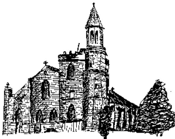
CHURCH OF THE HOLY ASCENSION, SETTLE GRADE II LISTED BUILDING