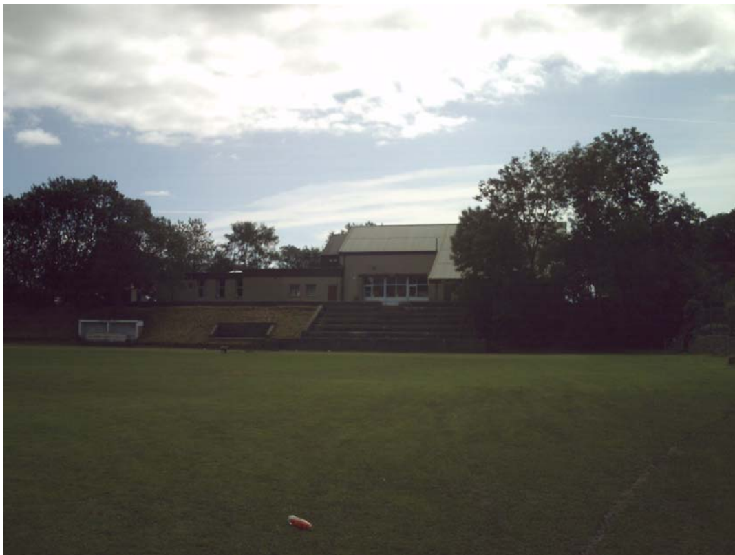
Figure 15. Seating for spectators in the form of small concrete steps.