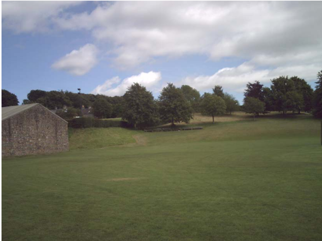
Figure 14. Seating visible on the slope at the side of the pitch.