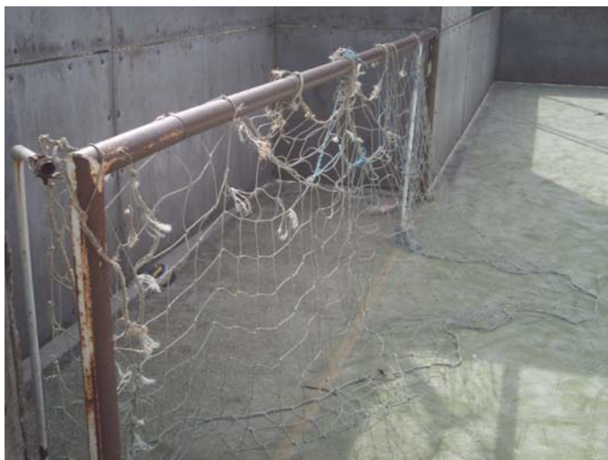
Figure 6. Football nets are old and in need of replacement.