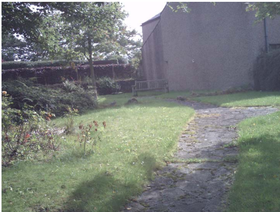
Figure2. View visible from the road.

No evidence of play equipment on the site and no further development have taken place since the last visit in 2004.