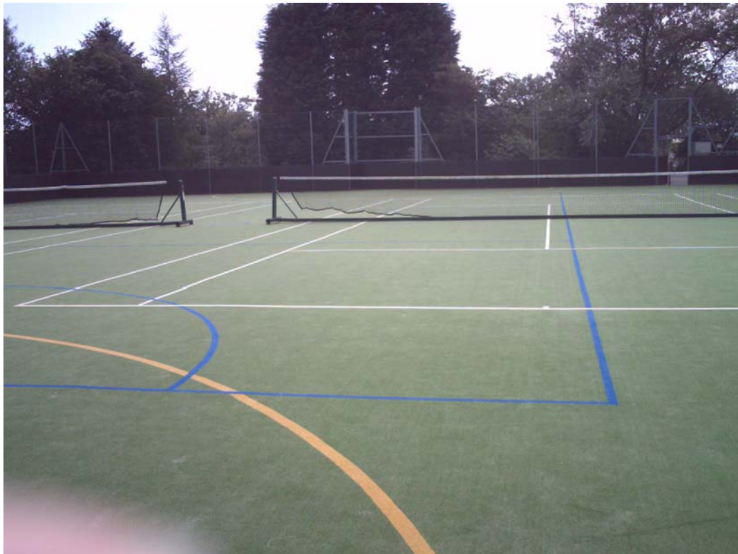
Figure 17. Multi-use games area in good condition, built recently, covering land that used to be old tennis courts.