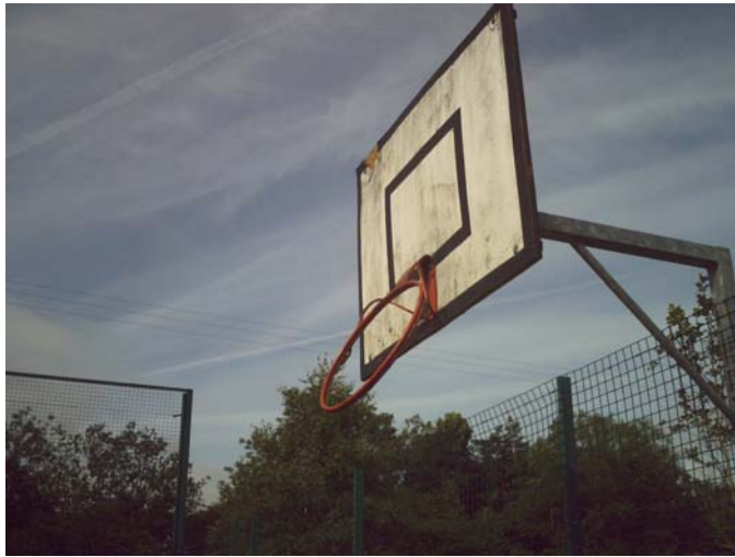
Figure 5. Basketball nets need improving or replacing.

There is a full size football pitch at the site but no markings can be seen on the grass surface. A Multi-Use activity area is present which has 1 tennis court, 1 set of basketball nets and a mini football pitch also with net, but these are not in good condition.