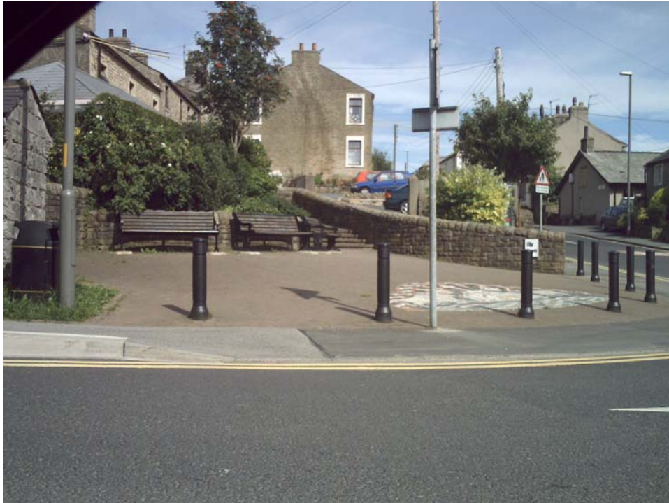
Figure 13. Cleveland Square, Civic Space in Bentham.

The condition of the site seems to have been improved as recommended by the last site visit. Benches are present and the area has been paved.