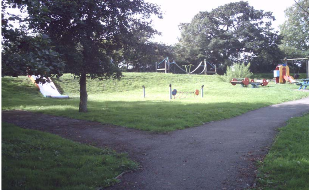
Figure 3. The left hand side of the site with older play equipment.

It is shown on Cartology as Childrens Play Area (8).