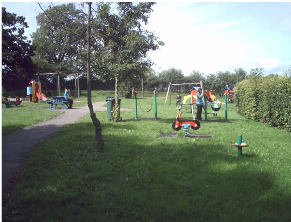
Figure 4. The right hand side of the site with newer equipment designed for smaller children.

The site appears to have been updated since the last Audit with new equipment. There was evidence of some rubbish but no vandalism or fly tipping.