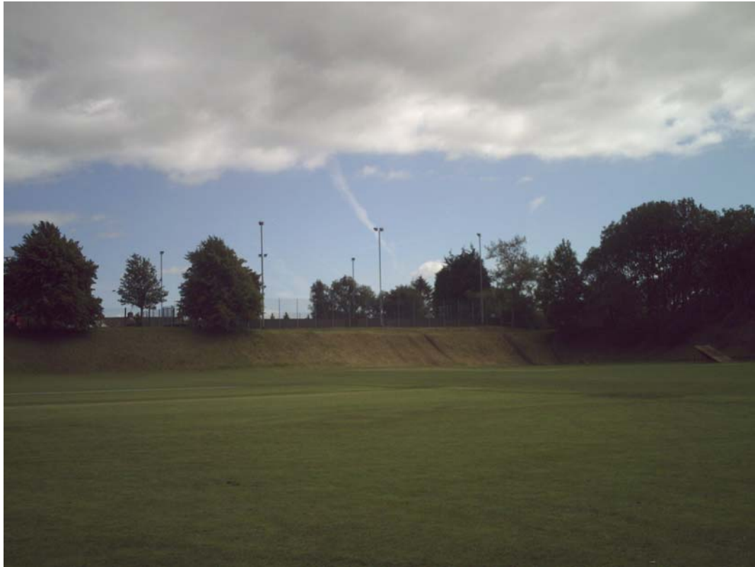
Figure 16. View of the wooden ramp and the multi-use games facility