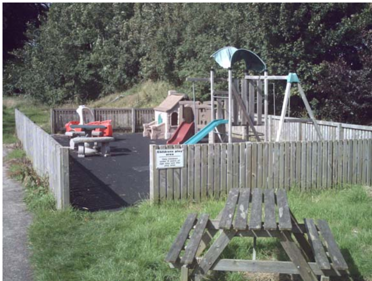
Figure 12. Children's Play Area that is next to the existing tennis court.

In 2004, a Children's Play Area was not mentioned as being present on this site. Equipment looks new and in good condition within a fenced area that increases safety. The Tennis courts next to the Play Area have only one entrance to the site, it is on the side of the Sports Club playing field. As a result of this, a temporary opening in the fencing has been formed that is unsafe and dangerous. The fence is rusty and falling down in places. This site needs improvements to ensure it is safe and can be used by the public.