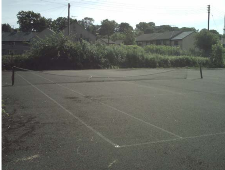
Figure 11. The run down tennis courts that are adjacent to the playing fields and the children's play area below. They have a tarmac surface and the nets are damaged.

On Cartology the site is shown as Outdoor Sports Facility (188).