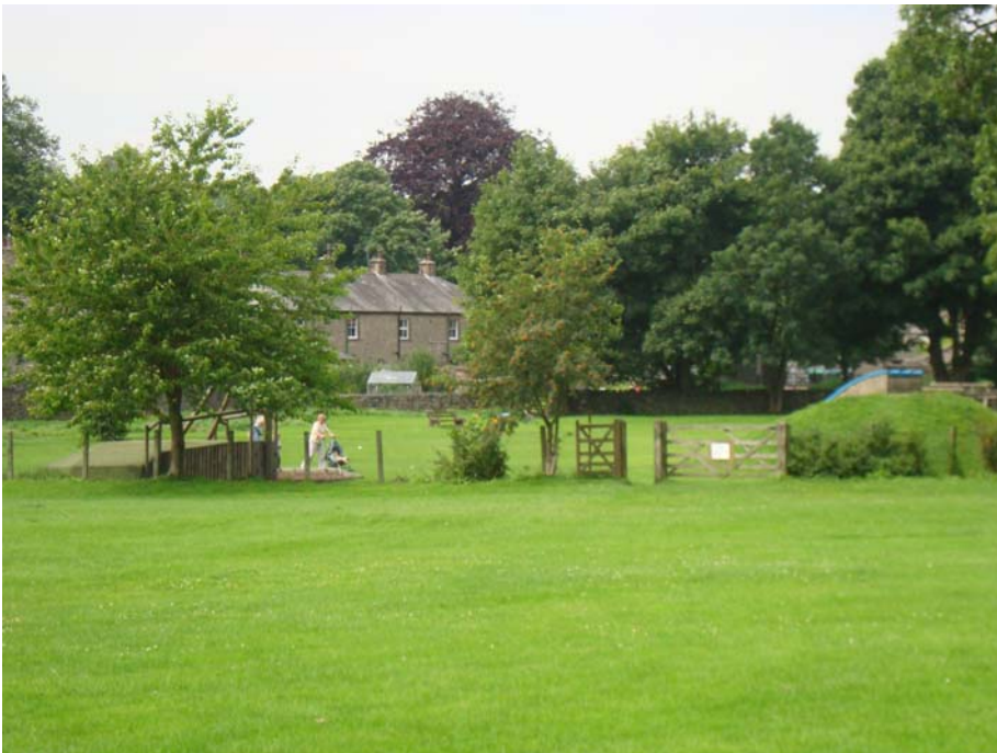
Figure 4. Equipment is in good condition.