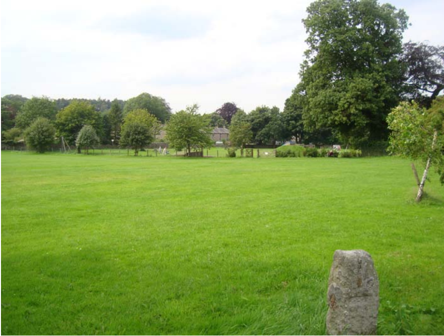
Figure 4. Site still has grass surface

This site is known as Harrison Playing Fields, Bankwell Road, Giggleswick