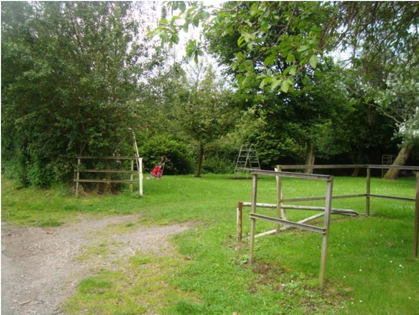
Figure 1. The small Children's Play Area is located in the corner of the site close to the entrance to the road. The gates are broken and this could pose a safety risk.

It is shown on Cartology as Children's Play Area (250).