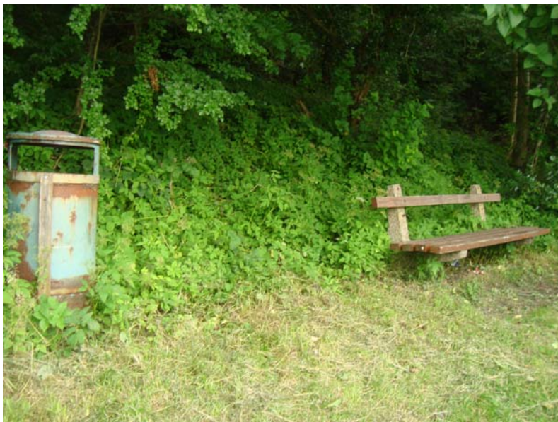
Figure 6. Benches and bins used to keep the area clean may need improving.