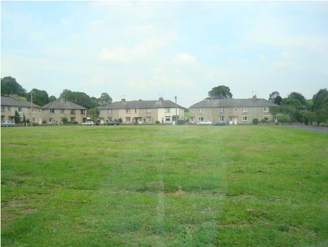
Figure 3. Only amenity greenspace was found at this location, no play area was visible.

In the original Action Plan this site was said to have a playing area that was rusting and needed improvements, on the visit to the site no play area was found.